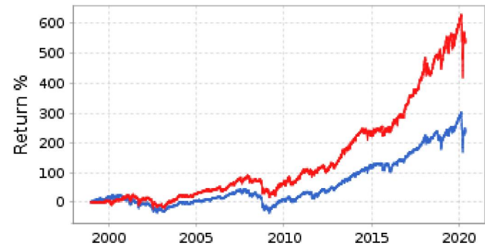
ortfolio123 | Data provided by S&P Global Market Intelligence and ICE Data.