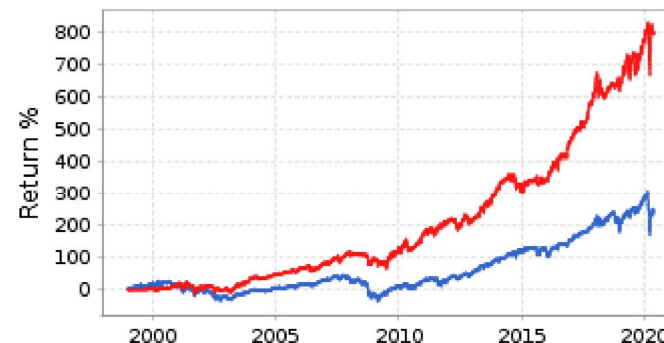
Portfolio123 | Data provided by S&P Global Market Intelligence and ICE Data.